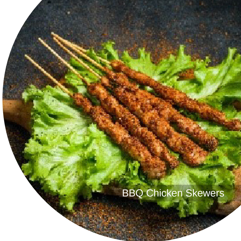
BBQ Chicken Skewers