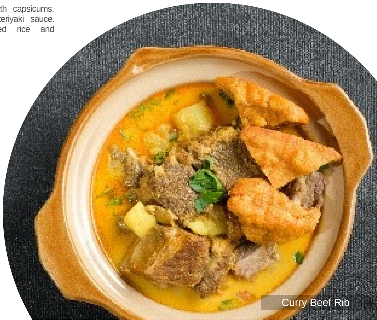
Curry Beef Rib