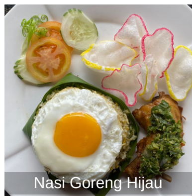
Nasi Goreng Hijau