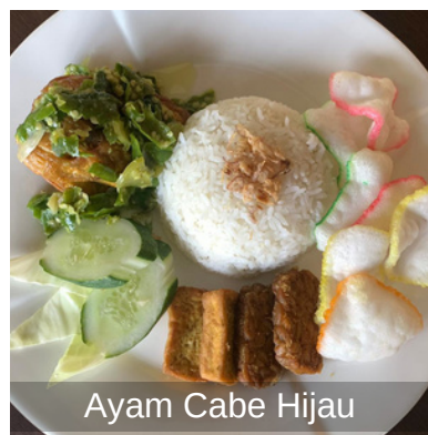
Ayam Cabe Hijau