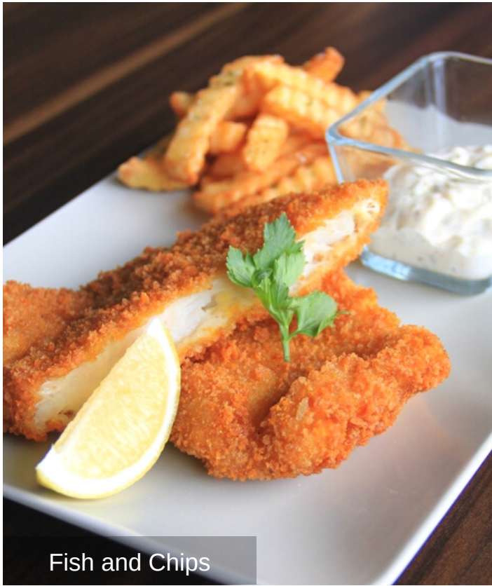
Fish and Chips