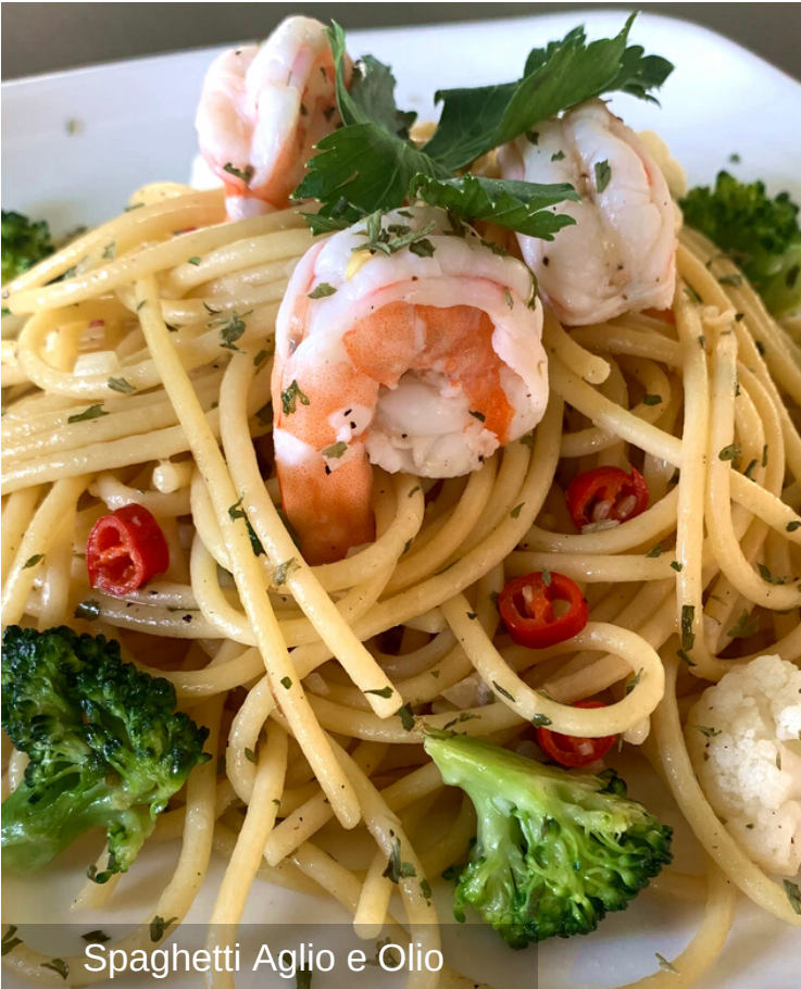
Spaghetti Aglio e Olio

Grilled Chicken Breast IDR 150,000 Grilled chicken breast with home-made mushroom sauce served with fries.