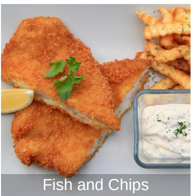
Fish and Chips