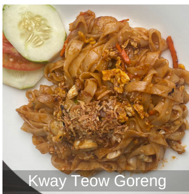
Kway Teow Goreng