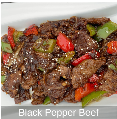
Black Pepper Beef