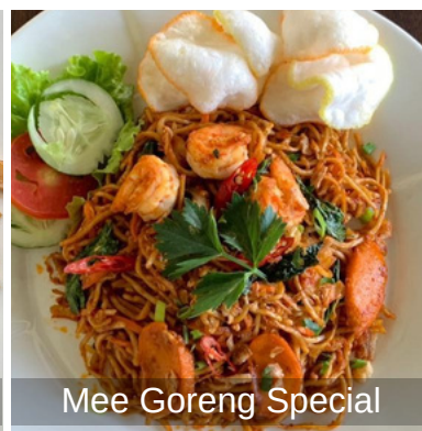
Mee Goreng Special