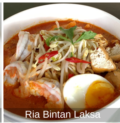
Ria Bintan Laksa