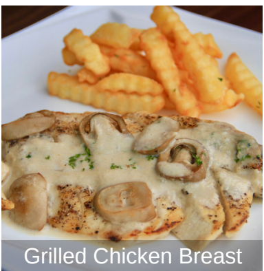
Grilled Chicken Breast