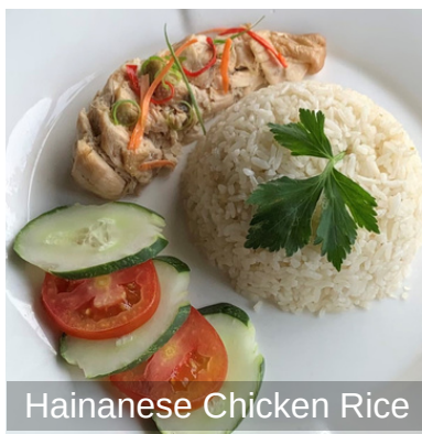
Hainanese Chicken Rice