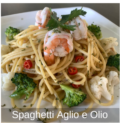
Spaghetti Aglio e Olio